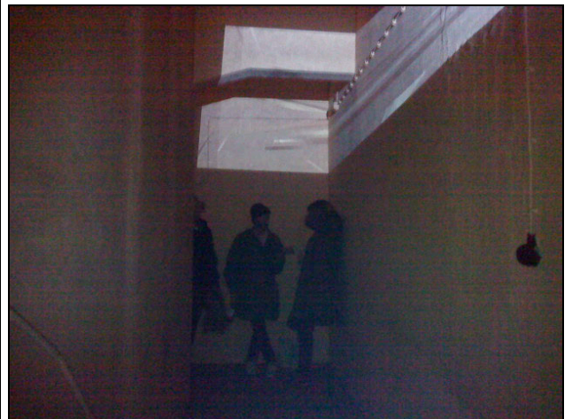
Pictures only with flash possible.